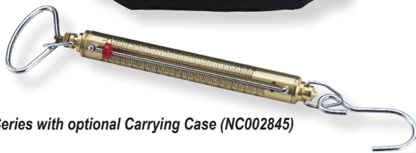
IN Series with optional Carrying Case (NC002845)