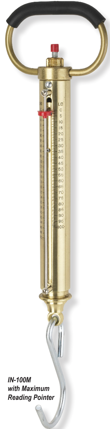
IN-100M with Maximum Reading Pointer